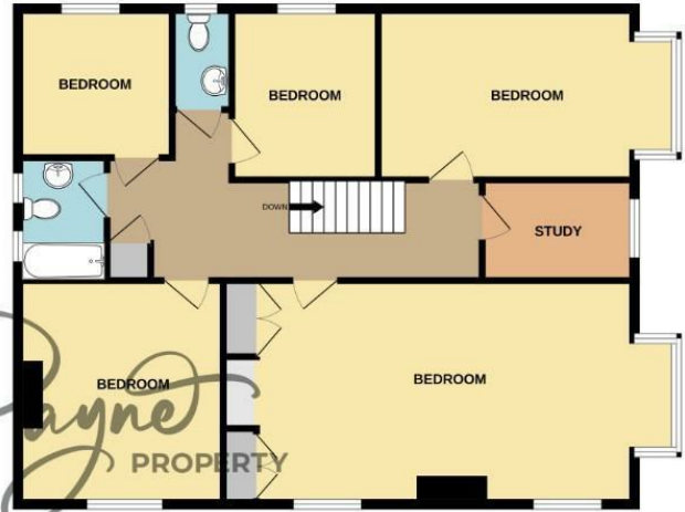
1ST FLOOR 1001 sq.ft. (93.0 sq.m.) approx.

TOTAL FLOOR AREA : 2322 sq.ft. (215.7 sq.m.) approx.